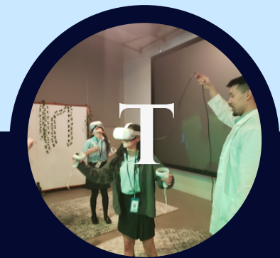
Communications, Media & Learning Technologies Design (CMLTD)

On the following pages, see the courses offered in the Department of Mathematics, Science, and Technology. Contact Instructors to learn more about the courses! See you in MST Summer School!