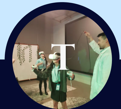
Communications, Media & Learning Technologies Design (CMLTD)