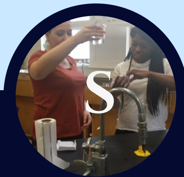
Science Education Program