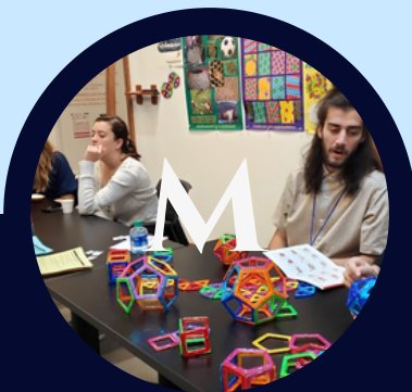
Mathematics Education Program

Whether you're looking to catch up, get ahead, or explore new subjects, our diverse range of courses has something for everyone. From core subjects to specialized electives, our expert instructors are here to guide you every step of the way.