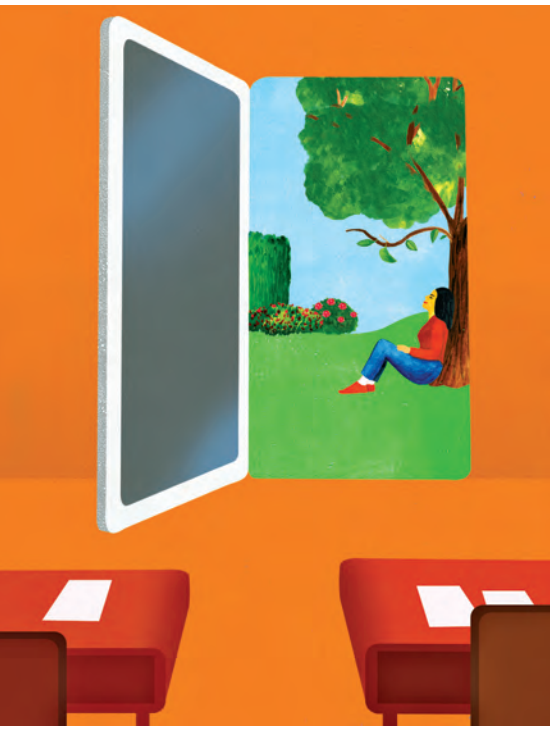
Illustration: Ellen Weinstein