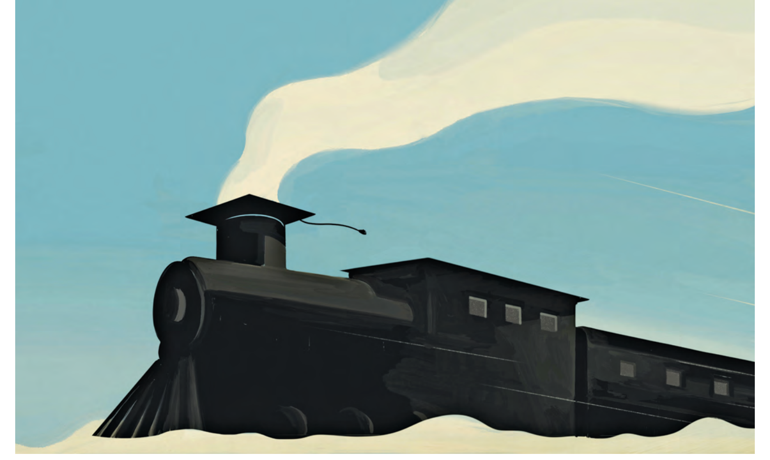
Illustration: Carlo Giambarresi