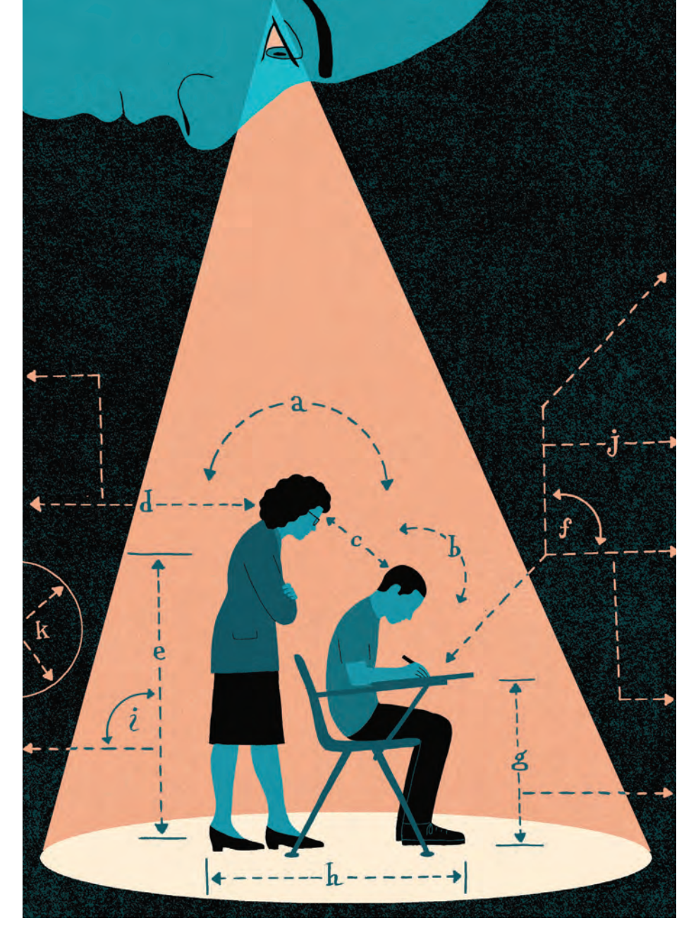
Illustration: James Steinberg