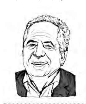
"Think about how draining it is to run a twohour birthday party with 20 seven-year-olds."