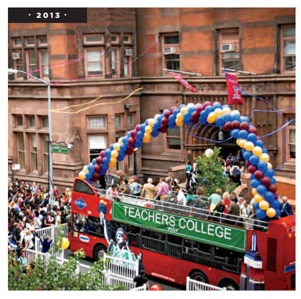
Big Day on TC Way

Balloons were in order as New York City proclaimed September 3<sup>rd</sup>, 2013, as TC Day and co-named West 120<sup>th</sup> Street as "Teachers College Way."